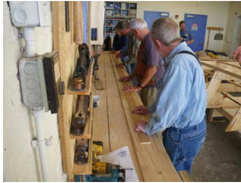
All hands on deck for getting out the first plank